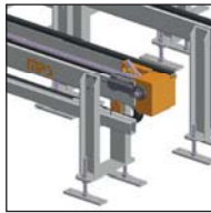
Transverse transport infeed or outfeed