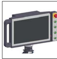
Machine interface (MPS control)