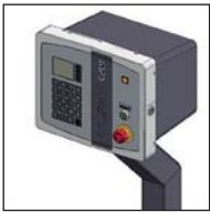
Support control panel